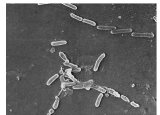
Figure 1: Pseudomonas aeruginosa (scanning EM)

EBS-I-102 is specific for serotype 6C and does not react with other serotypes. Pseudomonas aeruginosa is a Gram-negative, aerobic, rod-shaped bacterium with unipolar motility. It is an opportunistic pathogen of plants and humans and can infect the urinary tract, respiratory and gastrointestinal system, soft tissues, bones and joints leading to severe systemic infections of immunosuppressed patients in hospitals. P. aeruginosa secretes a variety of pigments, including pyocyanin (blue-green), fluorescein (pyoverdin), and pyorubin (red-brown). This organism can achieve anaerobic growth with nitrate as a terminal electron acceptor, and, in its absence, it is also able to ferment arginine by substrate-level phosphorylation. Adaptation to microaerobic or anaerobic environments is essential for certain lifestyles of P. aeruginosa , such as during lung infection in cystic fibrosis patients where thick layers of alginate surrounding bacterial mucoid cells can limit the diffusion of oxygen.