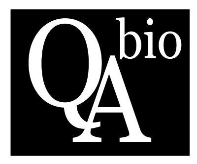
Endo F3 (Endoglycosidase F3) Endo-beta-N-acetylglucosaminidase F3