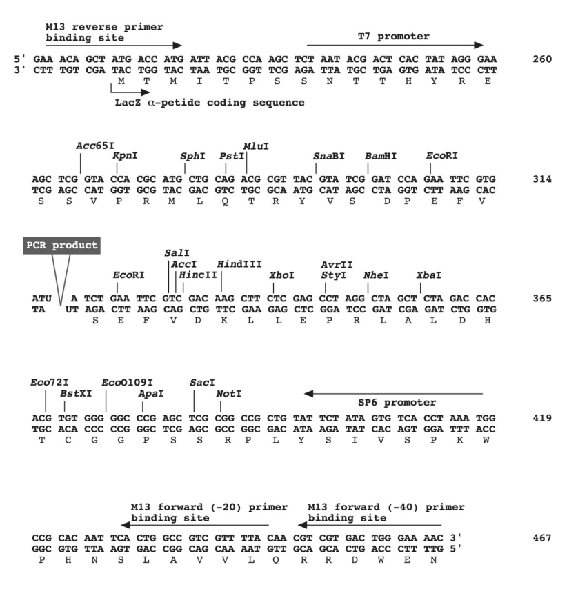
Figure 1. pDrive Cloning Vector Map. [A] Representation of the linearized pDrive Cloning Vector with U overhangs. The unique restriction endonuclease recognition sites on either side of the cloning site are listed. [B] Positions of various elements in the pDrive Cloning Vector. [C] DNA sequence of the region surrounding the cloning site. The amino acid sequence of the LacZ α-peptide is also given. The positions of the T7 and SP6 promoter sites and the M13 forward and reverse sequencing primer binding sites are provided, as are the cutting positions of the unique restriction endonucleases.